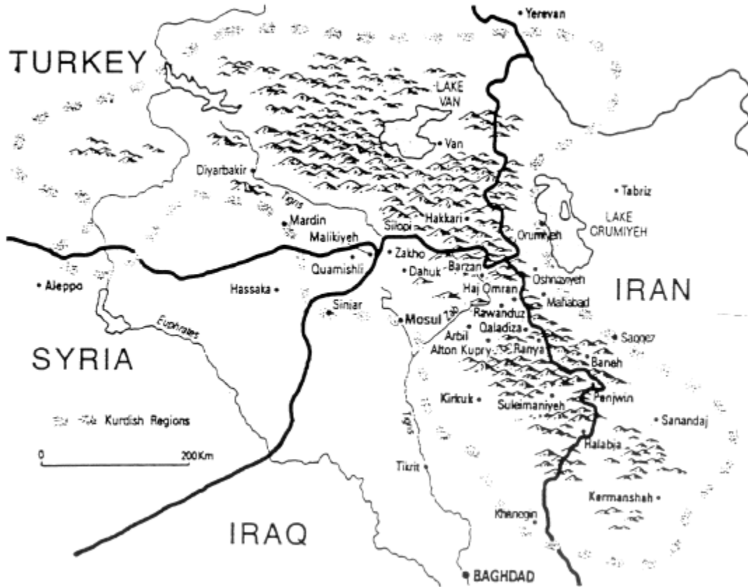
Map of Kurdistan